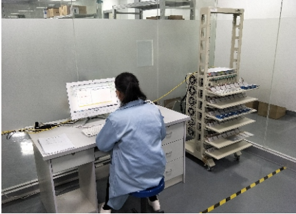
充放电系统 CC/CV 恒流恒压充电 精密度0.0001 Battery Charge-discharge Tester Constant Current and constant Voltage Accuracy 0.0001