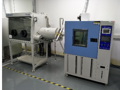
强制内部短路试验机&手套箱 电压实时监控≥100次/s 压力可控可调 Forced internal short circuit test machine &Golve box Real-time monitoring voltage ≥100 times per second Voltage can controlled and adjusted