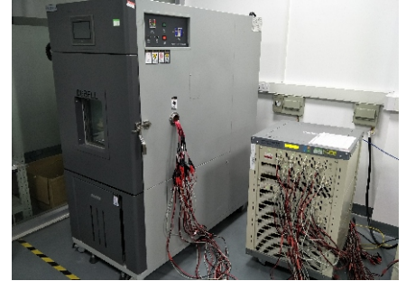
快速升降温试验箱 30min内高低温转换 Rapidly rising-descending temperature test chamber Change from 72°C to -40°C in 30 min