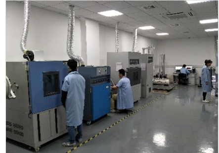
实验室 Testing Lab