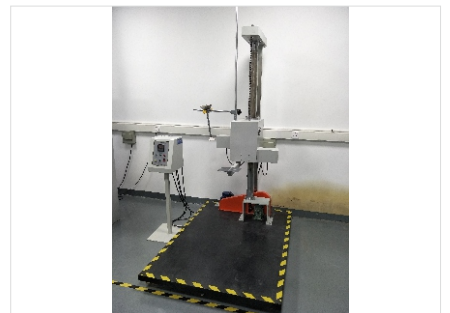
跌落试验机 1.2m高度 6个方向跌落物品 Drop test machine 1.2m height Free fall from six orientation