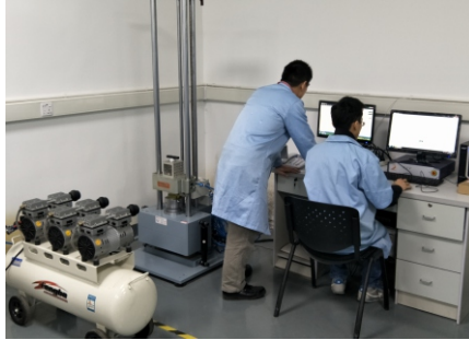
冲击台 多个冲击圈 峰值加速度125g至175g Shock Tester More chosen shock ring Peak acceleration 125g~175g