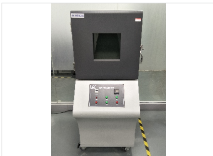
模拟高空低压试验箱 保压≥98% 自动补压 Simulated altitude low pressure test chamber Pressure maintaining≥98% Automatic pressure