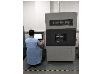
挤压试验机 精度0.001 压力、位移、电压可同时监测 Crust testing machine Accuracy:0.001 Force/displacement/ voltage Monitored at same time