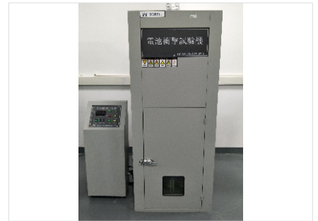
撞击试验机 高度可调 重锤9.1kg/10.0kg Impact tester Height adjustable Heavy punch: 9.1kg/10.0kg