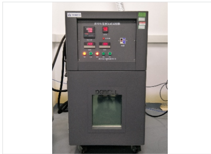
外部短路试验箱 内阻:80±20ohm 温度可控 External short-circuit testing machine Internal resistance: 80±20 ohm Temperature controlled