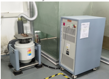
振动系统 正弦扫频、随机扫频 频率、加速度、位移可调 Eletromagnetic Vibration Tester Sine frequency sweep/ Random frequency sweep Frequency/Acceleration/ displacement adjustable