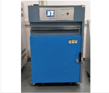
热冲击试验箱 速率：5±2°C/min 温度、时间可实时监控 Thermal shock test chamber Rate:5±2°C/min Temperature &Time real time monitor